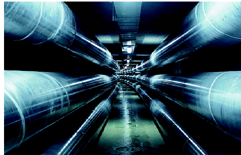
Figure 2 Multiple Gas Insulated Lines

1.14.5 Six of these tubes could be buried in a trench 3 m wide and 3 m deep beside or down the centre of a motorway, figure 2.